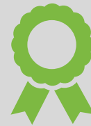
Nationally Accredited Mediators