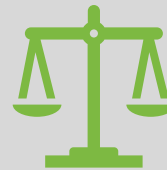
Parties or Court appoint