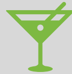
Victorian Bar Office